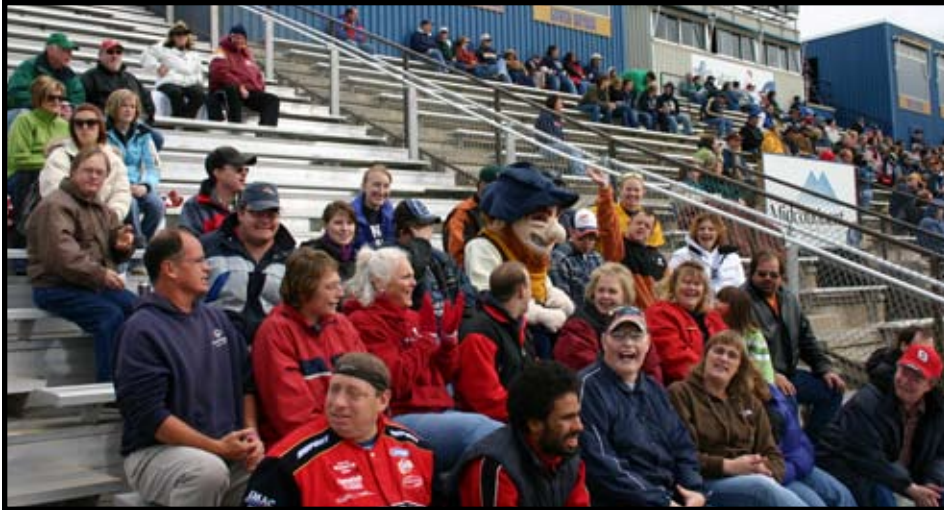
Heroes & Hardrockers participants enjoyed the football game before the rain started.

After the initial kick-off, Heroes & Hardrockers first event was on Halloween night. Seven people from Black Hills Workshop joined Circle K members in trick-or-treating for canned goods which were donated to the food bank.