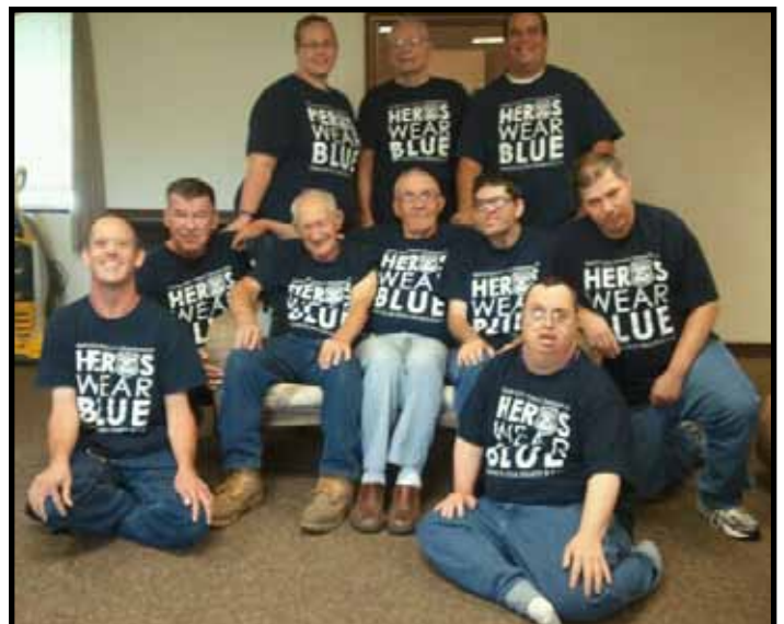
Residents of Edwards A show support for police officers.